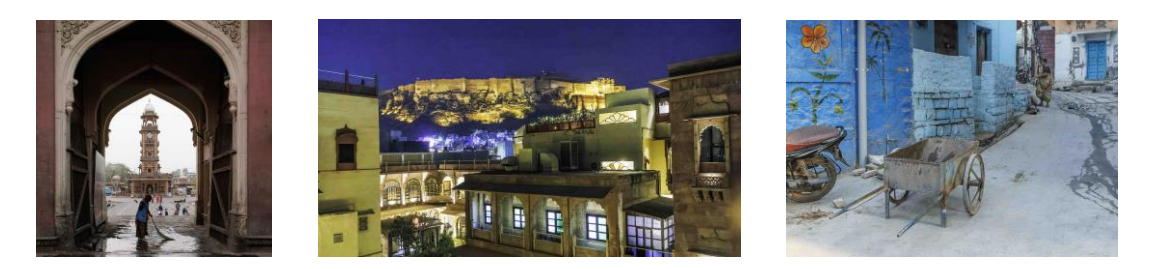
Nov 20th - Jaisalmer to Jodhpur

As the sun sets and a handful of musicians and dancers join us in the sand dunes for a private shoot. We then head back to the camp for more music and dance and a buffet dinner.