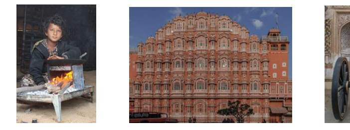
Nov 25th - Pushkar to Jaipur

Today we travel to Pushkar. A busy town on the edge of the Thar desert and a centre for camel trading. This evening we will go to town. The centre of town is home to a highly regarded Brahmin temple and a large lake which is surrounded by ghats where the faithful bathe in the holy waters. Unfortunately, you cannot take photos of the bathers however we are friends with holy men who will bless us and musicians who will play for us on the water's edge giving plenty of opportunity for photography.